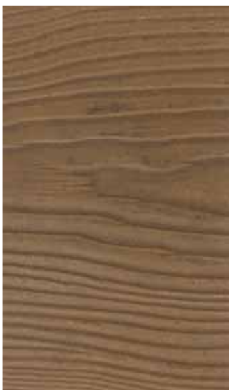
MW04 Dark Oak