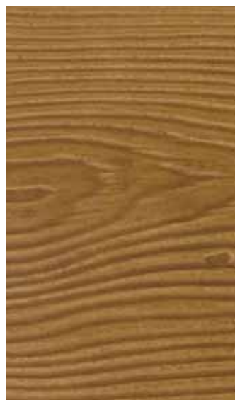
MW02 Light Oak